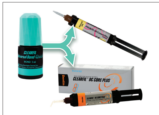
Figure 2. Simplified technique when used with a resin cement or core build-up material.