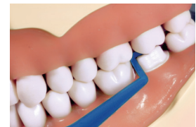
M Tip confirms mesial-half clearance

*Please consult with your milling block manufacturer or dental lab for indications for specific crown materials*