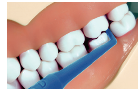
D Tip confirms distal-half clearance