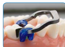
Secure fit at gingival margin

Fits securely along the gingival margin for better overall adaptation